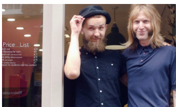
COMMUNITY, CONTRIBUTOR TIPS Shoot Brief: Small Business