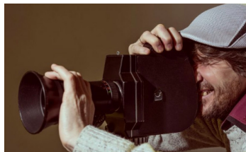
COMMUNITY, PRO TIPS 5 Tips on Running a Succes...